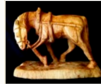
Heavy Burden (elm wood)