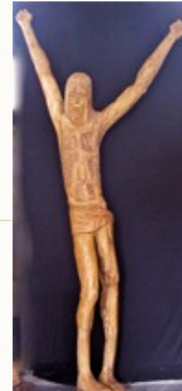
Crucifix (elm wood, 10.5 ft.)