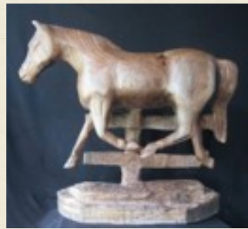
Flying Horse (Elm wood)