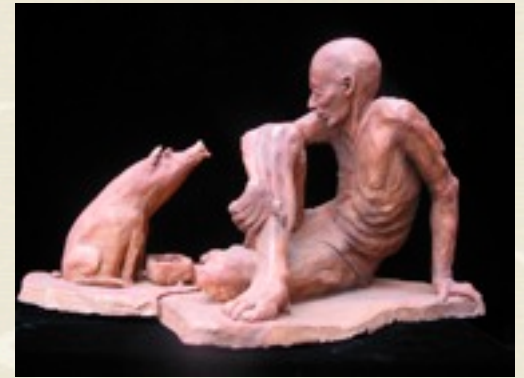
Prodigal Son and Pig

“Words alone can’t say what we feel about love, loss, death, wonder, and astonishment. I sculpt to express what we feel when words cannot say it. My sculptures are figurative and abstract ways of communicating about the edges of human experience. My work might be called religious or humanistic or political; but I do not draw boundaries between these areas. They are all united in that mystery beyond words.”