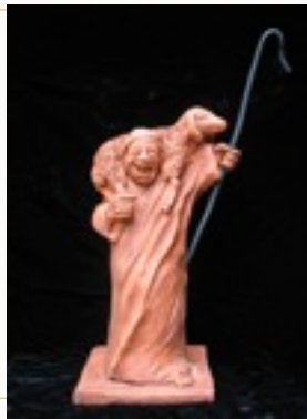
The Lost Sheep