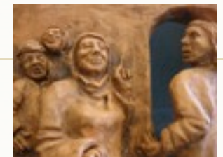
“Who are my Mother and brothers?”