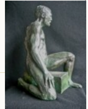
Old Fighter (bronze)